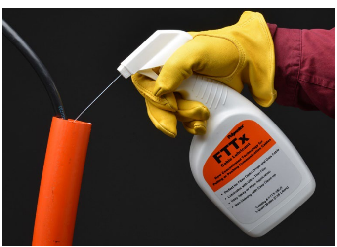
Polywater FTTx can be sprayed into small conduits

Meets MS-5/20xx Model Specification for HDPE Solid Wall Conduit for Power and Communications Applications.